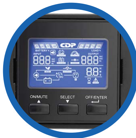
LCD panel with 90° rotation