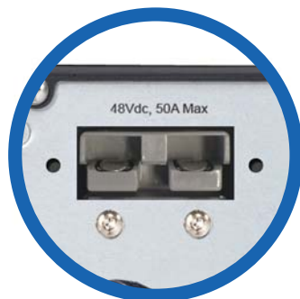
External battery bank input