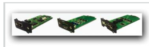
Optional SNMP and control PCB