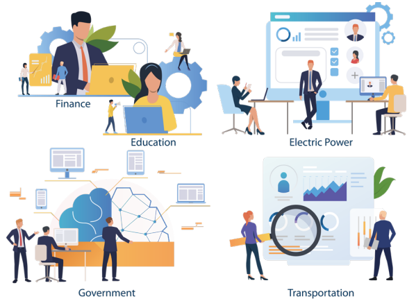
Broadband Private Network